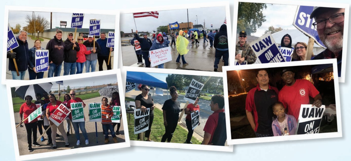
NABET-CWA members standing in solidarity with striking UAW workers.

central issues in the dispute is GM's insistence on using temporary workers, who often remain in that status for years without any path towards earning permanent status with the company. The Union would like to see this change. Additional items the union would like to see improve include fair wages, affordable healthcare, profit-sharing, and increased job security. ❖