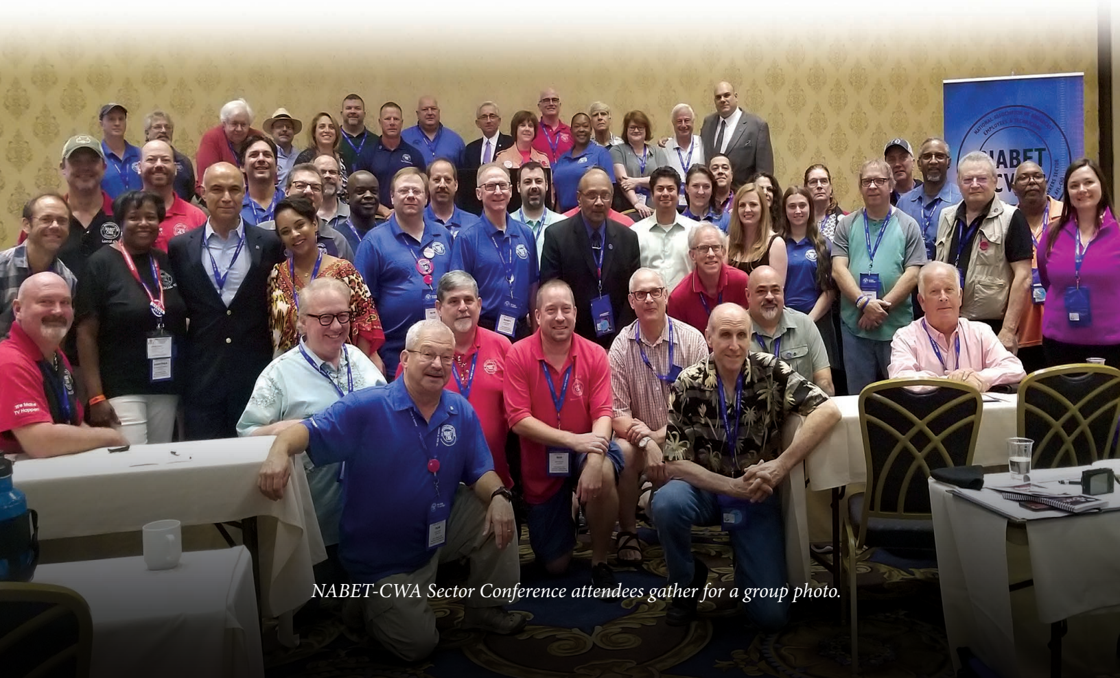
NABET-CWA Sector Conference attendees gather for a group photo.

During the conference itself, a number of resolutions were passed by the delegation. Resolutions included measures to posthumously honor Fred Saburro and Bill Wachenschwanz; support for the Public Broadcasting, National Public Radio, and the National